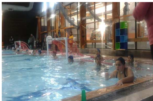
Our victorious flippaball team in action