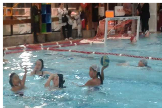
"Proud to be a Pomare Kid"