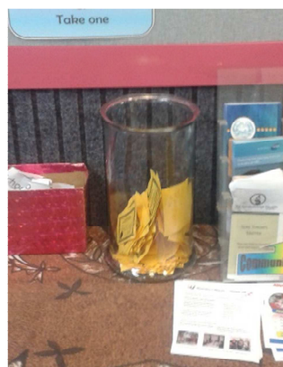
Gold Cards piling up!