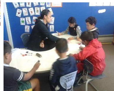
New whiteboard tables in action.