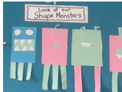
Geometry: 2D shapes