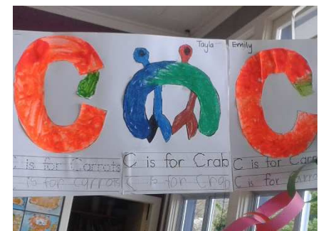
Literacy: Letter ID