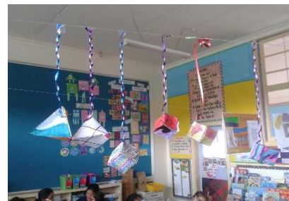
Geometry: 3D shapes